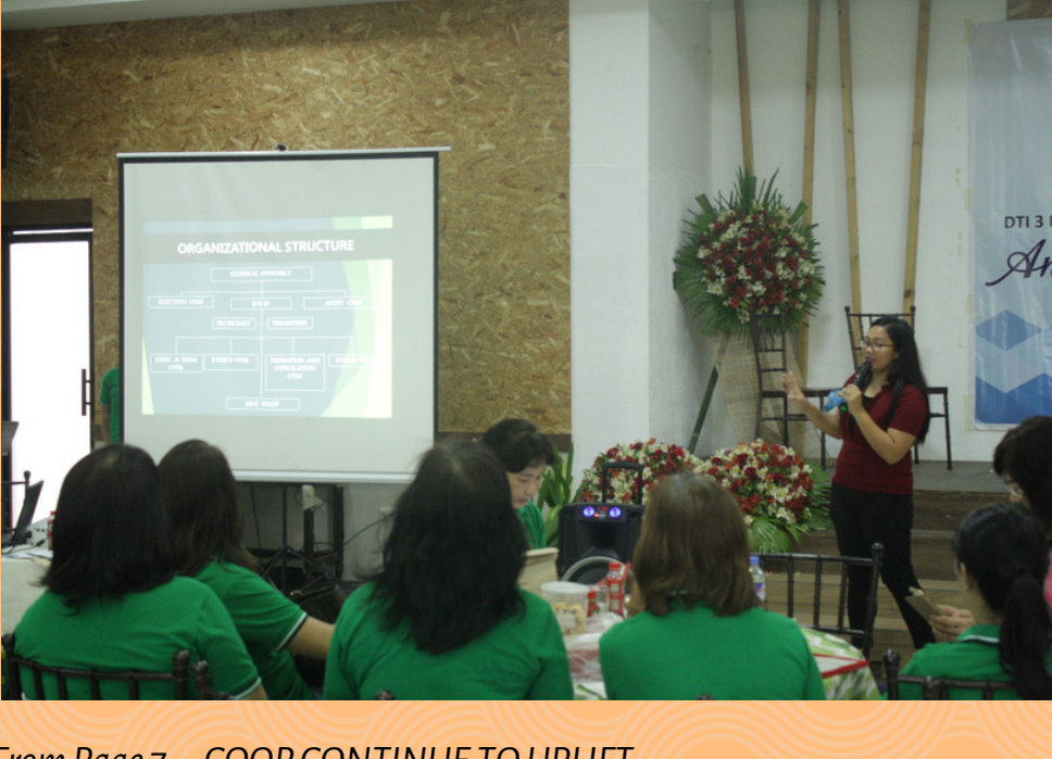
From Page 7....COOP CONTINUE TO UPLIFT

A total of Php 1, 591, 835.00 sales was generated during the week-long activity.