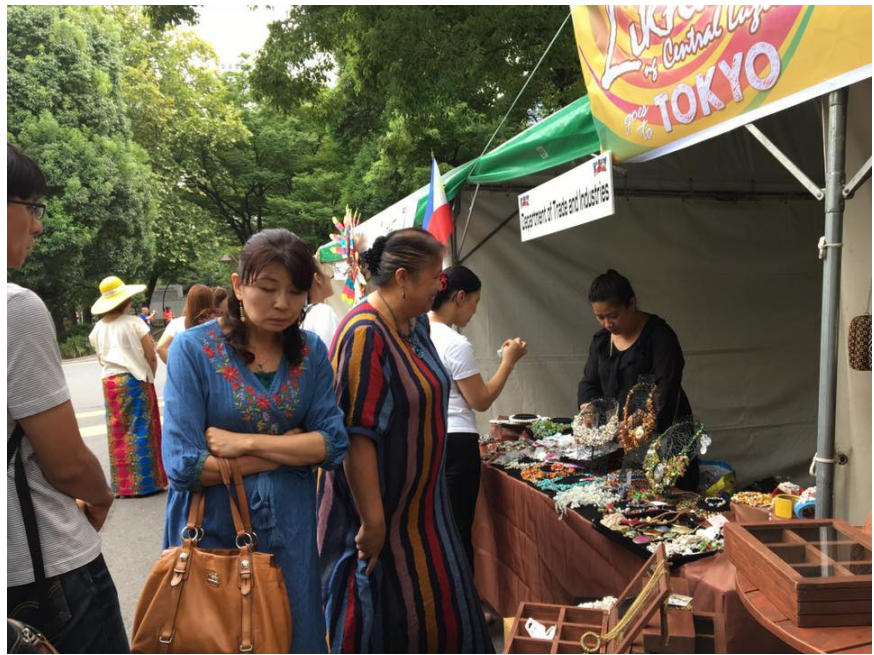
Japanese buyers admire Philippine made handicrafts and accessories from Central Luzon during the Philippine Festival in Japan

The Central Luzon entrepreneurs earned a total of 1.74 Million Yen for the two-day fair, aside from booked orders from two Japanese buyers. The DTI Regional Office is proposing that more entrepreneurs will join the next trade and investment mission in Japan in 2018.