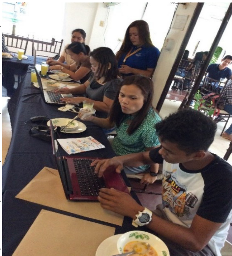
MSMEs in Baler try out their online presence during the E-commerce appreciation course held by DTI Aurora.