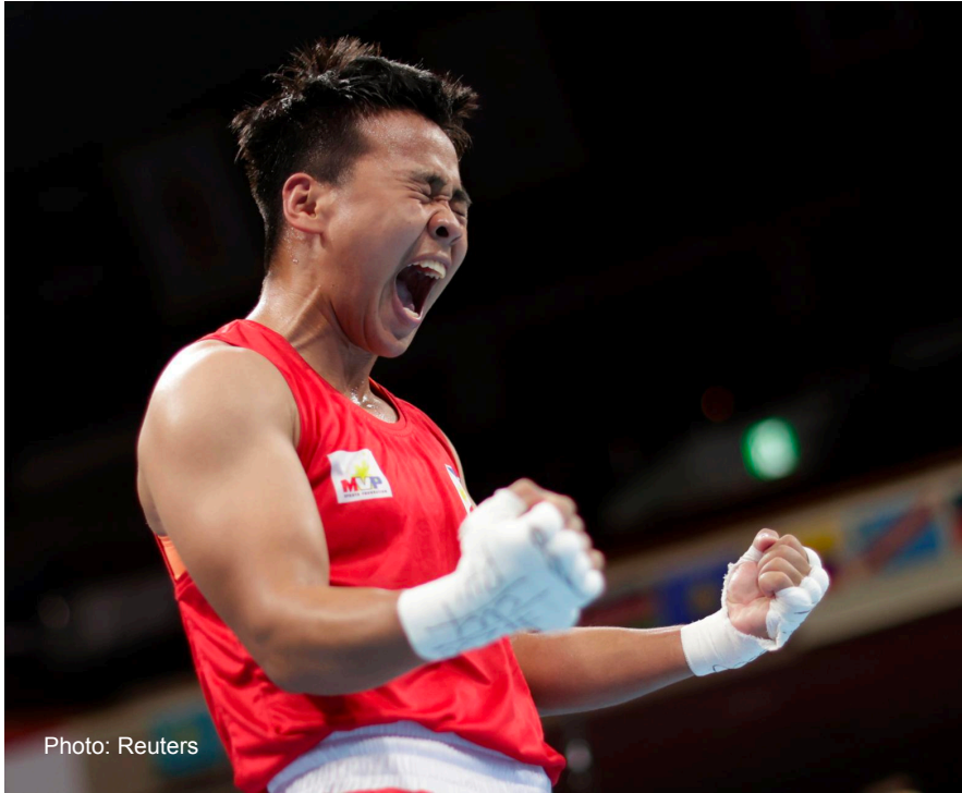
Nesthy Petecio Women's Featherweight Boxing