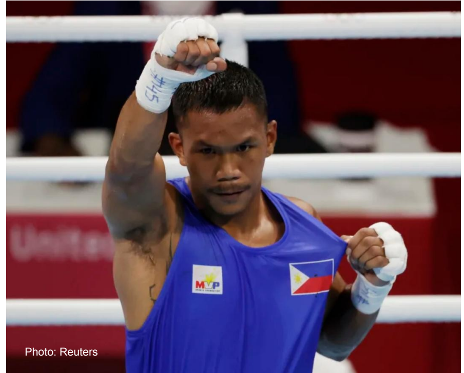
Eumir Marcial Men's Middleweight Boxing