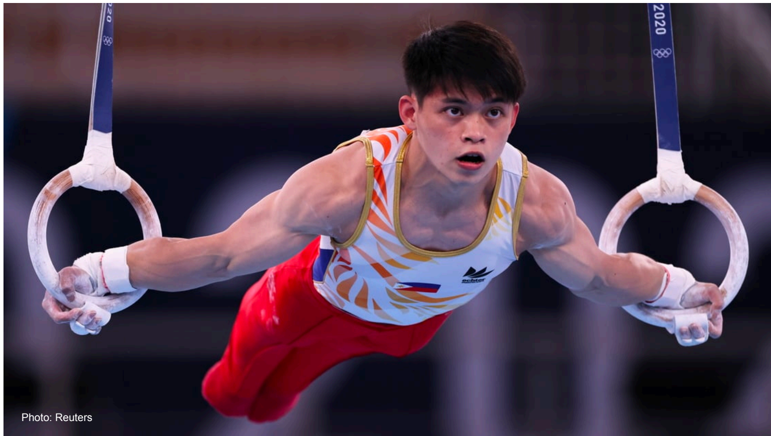
Carlos Yulo Gymnastics Men's Vault Apparatus Final