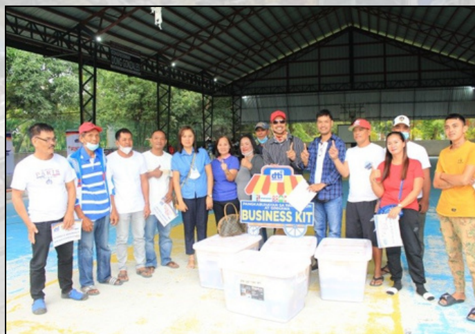
PPG awarding for 274 beneficiaries on December 29, 2022 at St. Jude Village, Brgy. San Agustin, City of San Fernando, Pampanga