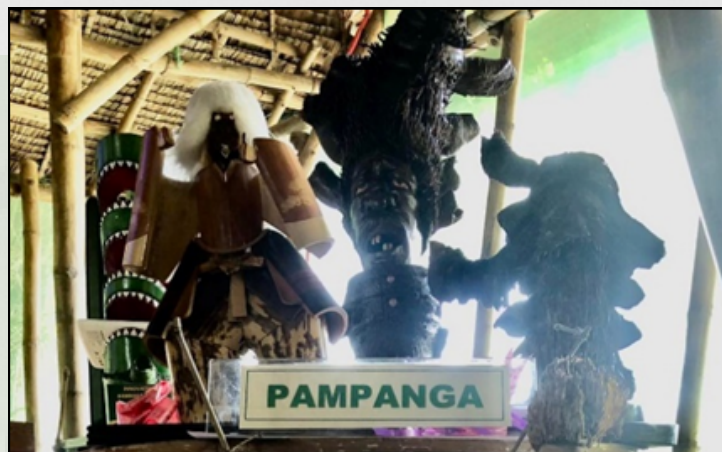
Pampanga's winning decorative entry - 'Bamboo Carving'

The entries are classified into decorative products and functional products. Decorative products are products that are used and function as decorative items such as but not limited to frames, candles holders, and products that are made to make a place attractive and appealing. On the other hand, functional products are those that are used as but not limited to fashion apparel, furniture, textile materials, kitchen utensils and products that are practical and useful. During the competition, the judges emphasized that all entries are excellent and appealing, and all the created entries can be exhibited on the national scene. The entries of Bataan introduced new designs such as the bamboo electric fan and the bamboo pen holder. Tarlac introduced a clock with calendar and a bamboo bike while Nueva Ecija enhanced the bamboo toothbrush and bamboo pillows.