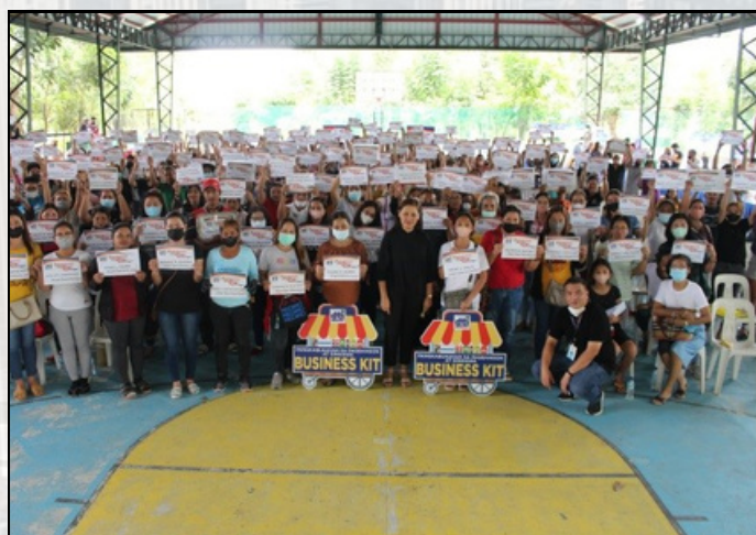
PPG awarding to 196 beneficiaries on December 19, 2022 at St. Jude Village, Brgy. San Agustin, City of San Fernando, Pampanga