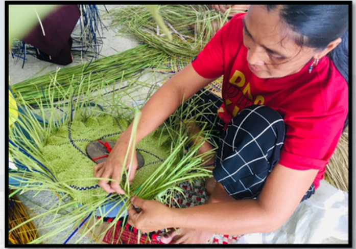
SABUTAN WEAVING. The Sabutan Weaving Skills Training participant on November 10-11, 2023, at Picnic Bay, Brgy. Sabang, Baler, Aurora.

Ms. De Leon demonstrated the process of harvesting sabutan, stripping it into fibers, and dyeing it to make stylish Sabutan fibers. In Aurora, sabutan is a palm tree used to create native products such as hats, mats, fans, bags, and novelty items. Some participants initially found sabutan weaving difficult, while others had previous weaving experiences. At the end of the activity, everyone was happy with the activity, especially when they have weaved their first sabutan products - fans and table mats.