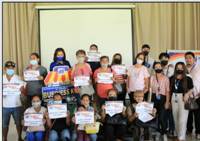
PPG awarding to 95 beneficiaries on November 03, 2022 at St. Isidore the FARMer Learning Center, Brgy. San Isidro, Santa Ana, Pampanga

To date, DTI Pampanga has awarded one thousand two hundred twenty-four (1,224) livelihood kits to PPG beneficiaries in the province.