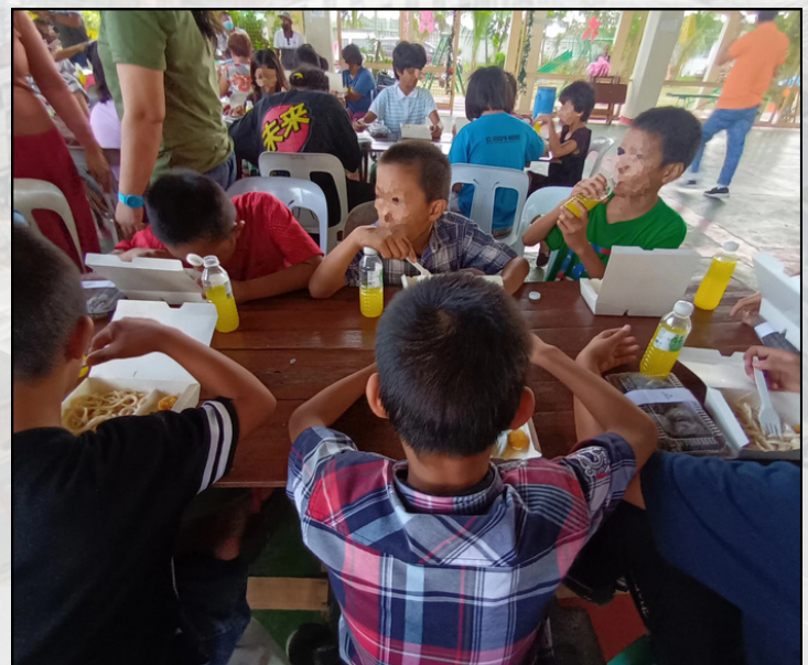
Children at the St. Joseph Home of Special Children in Tarlac City enjoy their sumptuous snack during DTI-Tarlac's gift-giving activity last December 16, 2022

With this mere act of sharing, the DTI Tarlac family would like to express that they are one with the institution's vision in making the children experience love, respect and worth as God's special ones.