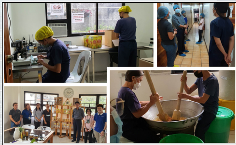
Visiting the AIDis Food production and exhibit area