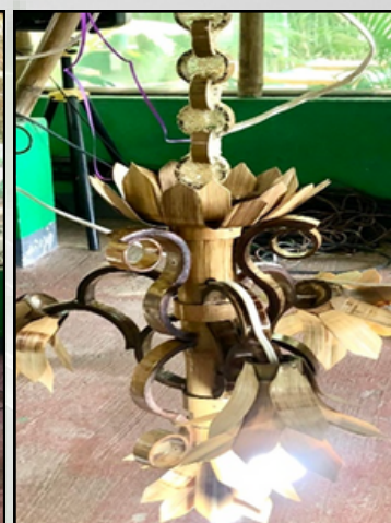
Left - Bataan's bamboo electric fan Right - Zambales' bamboo chandelier