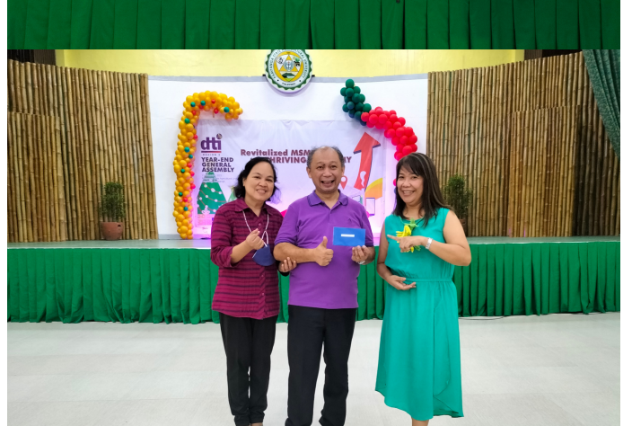
Year-end General Assembly Snapshots