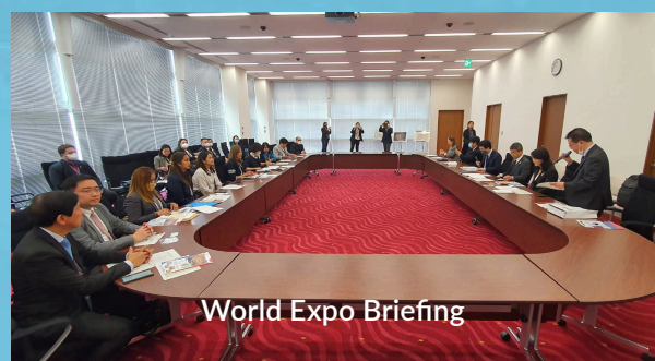
World Expo Briefing