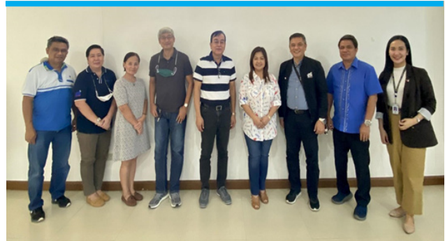
Mayor Esmeralda G. Pineda of LGU-Lubao with DTI-BOI and DTI Pampanga representatives.

Present during the meeting are BOI Executive