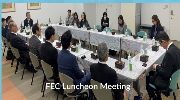
FEC Luncheon Meeting