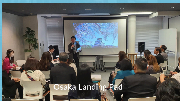
Osaka Landing Pad