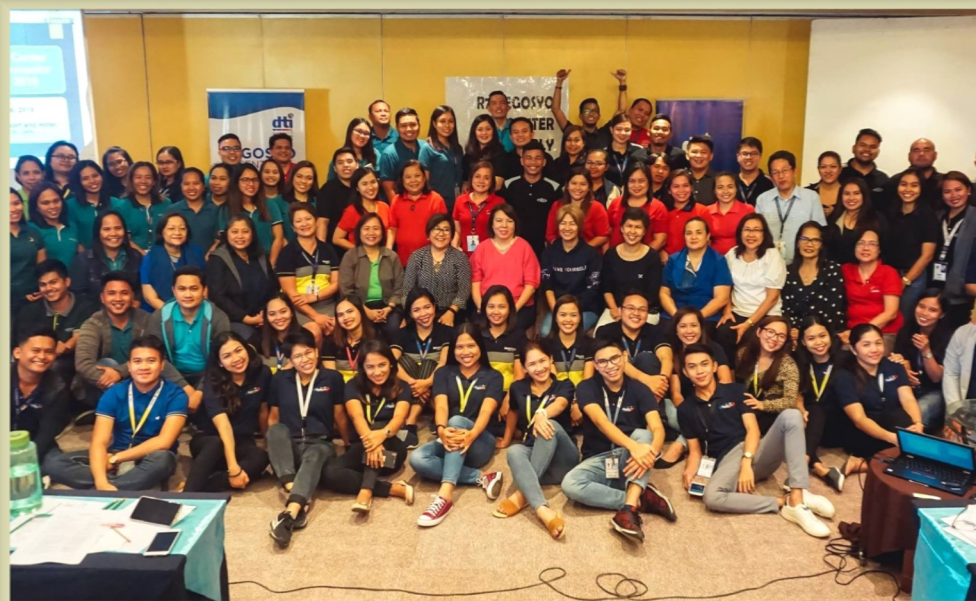
(Photo above) The Negosyo Center Region 7 Assembly was held at the Sotogrande Hotel and Resort in Mactan Island, Cebu on March 5 and 6, 2019.