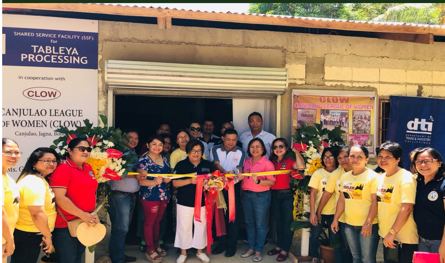
(Photos above and below) Launching of the SSF for Tableya Making Cooperator: Canjulao League of Women (CLOW) in Jagna, Bohol