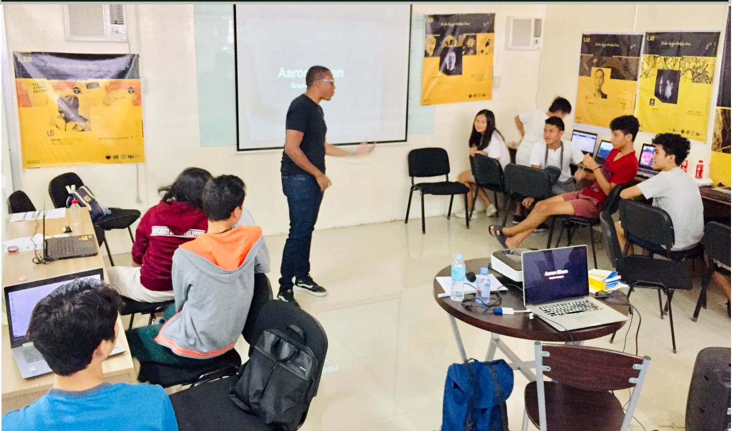
(Photo below) Graphic Design, Branding, Packaging Workshop in Siquijor.