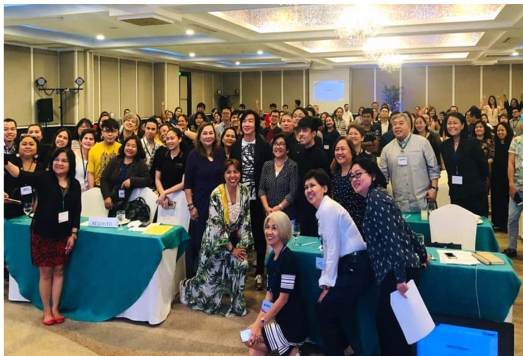
(Photo above) The 2019 National OTOP Design Conference was held at the Cebu Park-lane International Hotel, Cebu City on May 28-30, 2019.