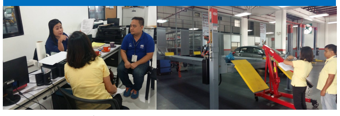
Physical inspection of the KIA repair shop in Bayanan I, Calapan City, Oriental Mindoro.

The Department of Trade and Industry - Oriental Mindoro Provincial Office awarded its first five star shop accreditation to Psuello Group Inc. (KIA Calapan) on February 23, 2016 for satisfactorily complying with the requirements for accreditation pursuant to Presidential Decree No. 1572. promulgated on June 11, 1978.